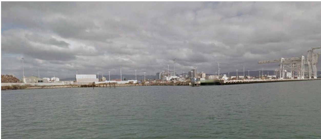
Figure 18: Viewpoint 10

View of northeastern Inner Harbor Turning Basin, Howard Terminal from the Inner Harbor Channel, looking northeast.