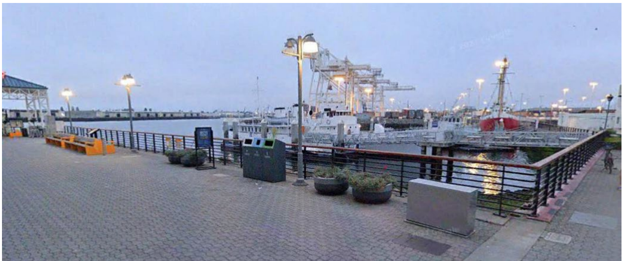
Figure 19: Viewpoint 16

View of the southern side of the Inner Harbor Turning Basin from the Public Plaza at the San Francisco Bay Oakland Ferry Terminal and Historic Ship Dock, looking southwest.