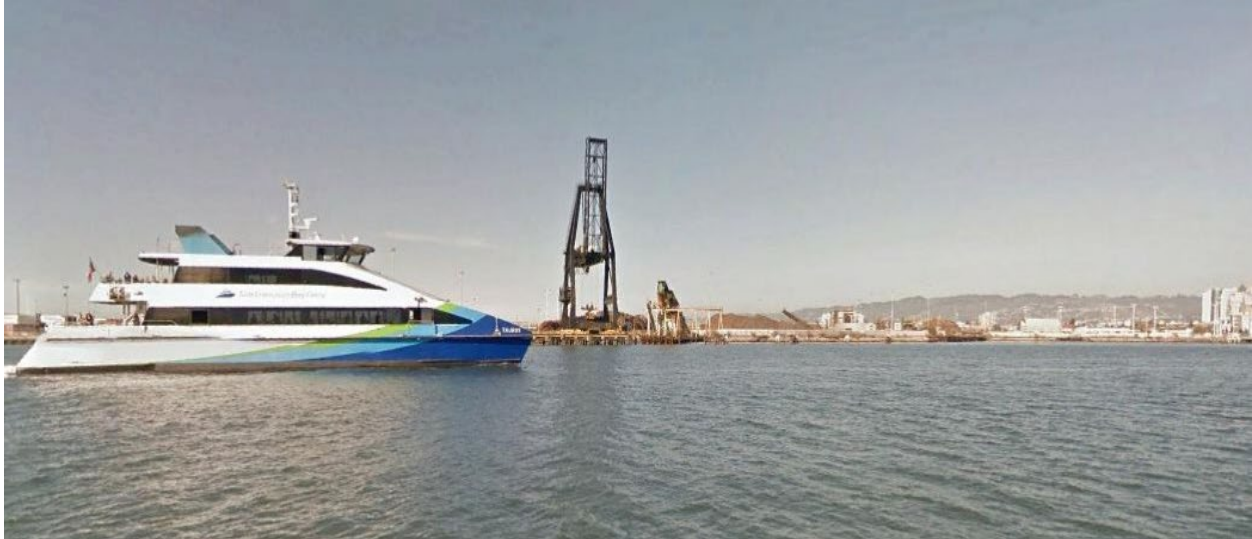
Figure 17: Viewpoint 9

View of Schnitzer Steel Facility with black mechanized crane, northwestern corner of Inner Harbor Turning Basin from the Inner Harbor Channel, looking north.