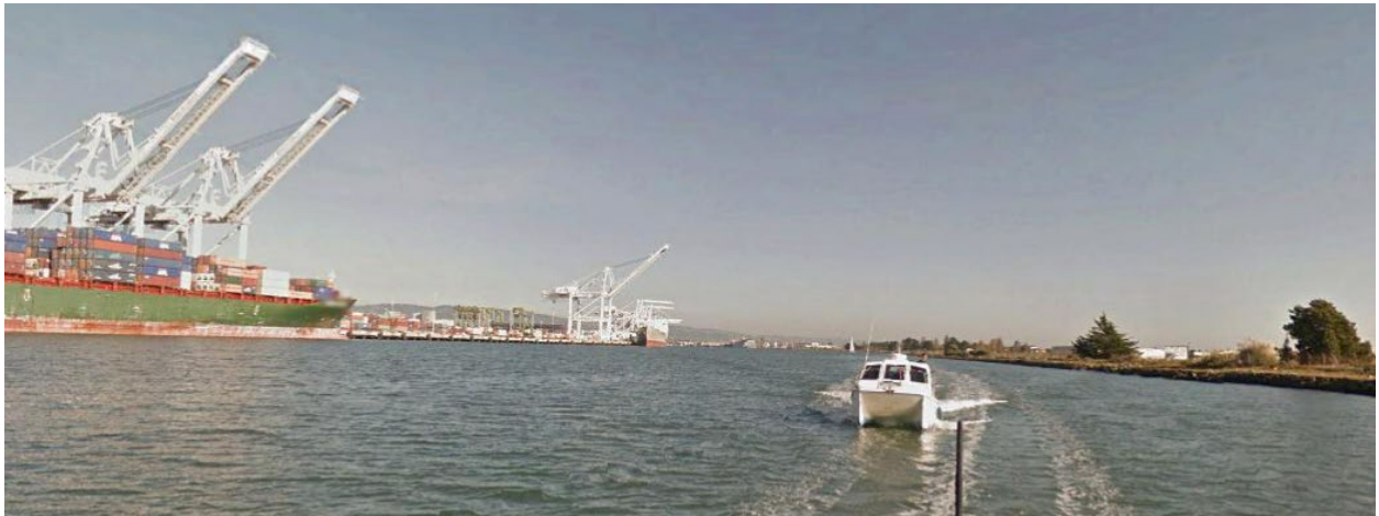
Figure 16: Viewpoint 6

View of Inner Harbor Channel and the planned Northwest Territories Regional Shoreline Park, from the Inner Harbor Channel, looking east.